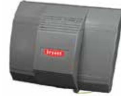
HUMCRLFP1518 - Fan-Powered Humidifier