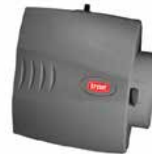
HUMCRSBP2412/HUMCRLBP2417 - Bypass Humidifier