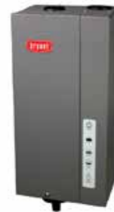
HUMCRSTM3134 - Steam Humidifier